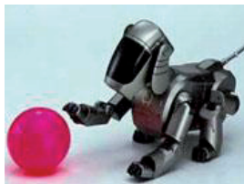
Aibo the robotic dog plays with a ball.

Imagine you've got a pet that doesn't wet the carpet, doesn't need food and never attacks people.